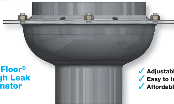
Sani-Floor® Trough Leak Eliminator